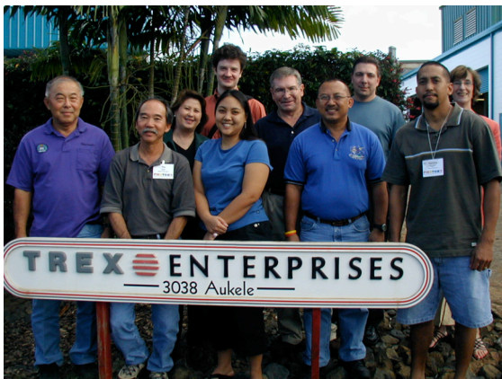
Figure 2. Industry site visit in Hawaii

The second day of each workshop was devoted to hands-on work with the PHOTON2 photonics lab kit. Participants learned about laser safety and practiced setting up the equipment, to prepare for the coursework to come.