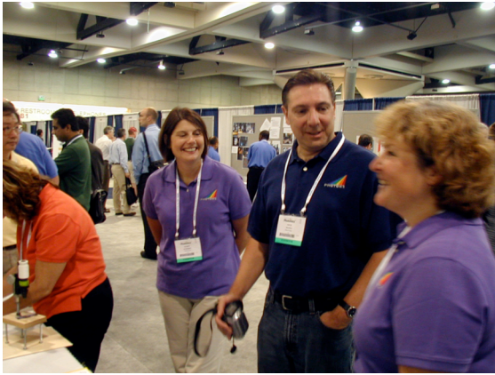
Figure 4. PHOTON participants at San Diego Showcase workshop

A collaboration with SPIE provided a perfect meeting venue for the PHOTON2 showcase workshop, held from August 14 – 17, 2006 in San Diego, California. Twenty PHOTON2 educators from across the country came together to share with each other and the attendees of the SPIE annual meeting how they have implemented what they learned during Project PHOTON2 and the “Introduction to Photonics” web-based professional development course.