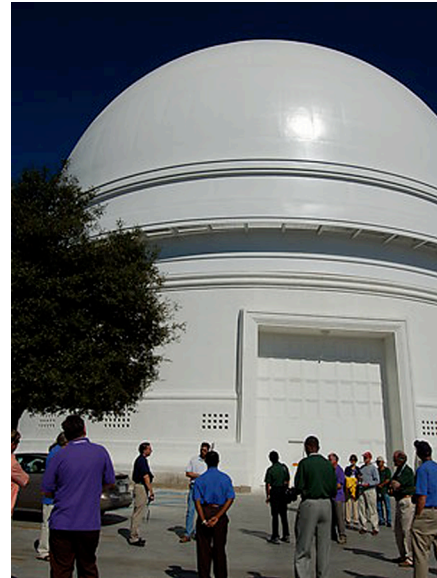
Figure 5. Visit to the world-class Palomar Observatory