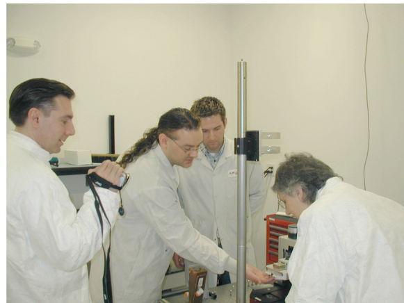
Figure 3. Visit to IPG Photonics, Inc.

Visits for developing the first three problem-based challenges were held at during spring 2007 at Photomachining, Boston University and IPG see Fig.3. The additional five Challenges will be developed during fall 2007 and spring 2008.