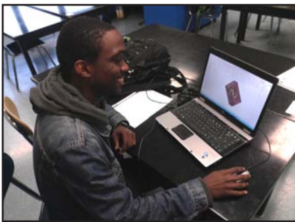
A student at The English High School in Mass. working on the FloDesign wind turbine Challenge.