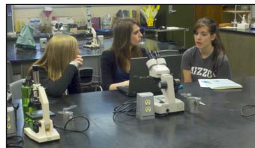
College students from Central Methodist University hosted secondary students from the Columbia Area Career Center to solve the J&J and TTF Watershed Challenges.

Field-testing began in 2010 and completed in spring 2012. The STEM PBL Challenges have been implemented in a variety of STEM disciplines across high schools, and two- and