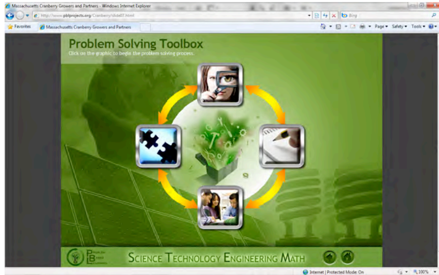
Figure 2. Problem Solving Toolbox with icons representing Problem Analysis, Independent Research, Brainstorming and Solution Testing.

For each of the four processes, students click on an icon that reveals a “Whiteboard” graphic designed to emulate an actual classroom whiteboard. The Whiteboards, shown in Figure 3, provide a systematic method for students to capture their thoughts, ideas, and learning strategies during each stage of the problem solving process. Students may cycle through the whiteboards several times for a given problem, revising their problem solution each time