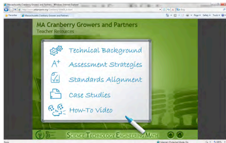
Figure 5. Teacher Resources.

For instructors, a comprehensive “Teacher Resource” section is included (see Figure 5) that provides technical background on the main concepts introduced, assessment strategies, implementation stories detailing how other instructors at different educational levels have