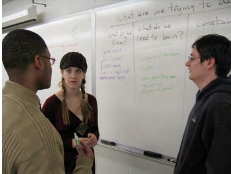
Figure 4. Students using the Problem Analysis Whiteboard.

until they converge on an optimal solution. For instructional purposes, the Whiteboards can either be printed or projected/copied onto an actual classroom whiteboard. (see Figure 4).