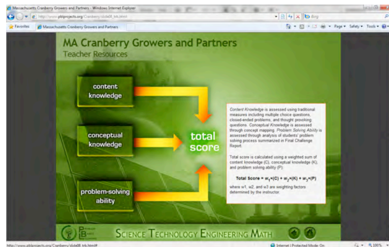
Figure 6 Student assessment strategies.

expertise” model adapted from the Vanderbilt-Northwestern-Texas-Harvard-MIT (VaNTH) Research Center for Bioengineering Educational Technologies [27] which involves three measures: content knowledge, conceptual knowledge, and problem-solving ability (see